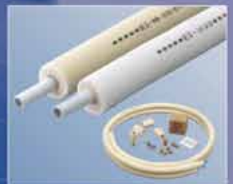
GREEN PIPING SYSTEM

Both INABA DENKO and SLIMDUCT are registered in Australia as trademarks of Inaba Denki Sangyo Co., Ltd. Osaka Japan. All rights are reserved.